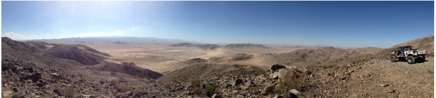
Means Dry Lake after it rained 4 inches in 18 hour period October 2018.